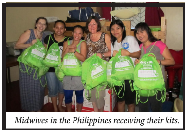
Midwives in the Philippines receiving their kits.

Flip flops and a toothbrush are also included as mothers often do not have these essentials.